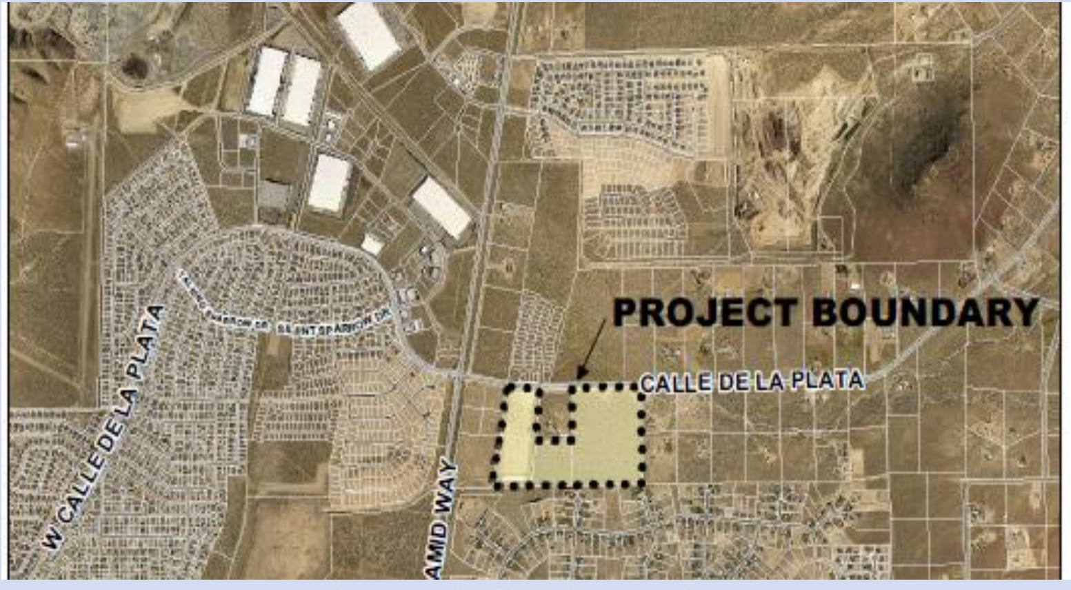
Washoe County Planning Commission July 6, 2021

Village Green Commerce Center Specific Plan