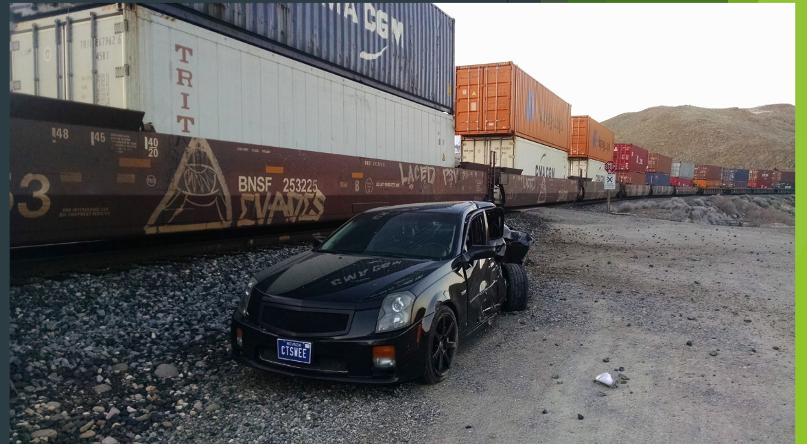
Photo: Vehicle hit by train in 2017 at this crossing. (Leonard, 2017)