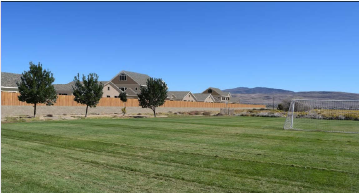
Exhibit 1 – Rendering of the approved 6'-tall fence atop the 6'-tall retaining wall

In lieu of paying for the appraised value of the easement area, Toll is proposing to mitigate impacts associated with the project by installing and maintaining park landscaping and constructing a trail within the park, in conformance with the Lazy 5 Regional Park Master Plan. An appraisal was conducted and determined that the value of the permanent easement area is $45,675.00 and the value of the temporary construction easement area is $54,907.00, for a total of $100,582.00. However, Washoe County Regional Parks and Open Space does not typically require payment for temporary easements. Toll estimates that the cost for the landscaping and irrigation on the slope will be approximately $6/sf or $78,102.00 and that the cost for the trail will be approximately $13,080.00. Given that the cost of the park improvements well-exceeds the appraised value of the permanent easement, staff is supportive of the proposed mitigation measures in lieu of payment.